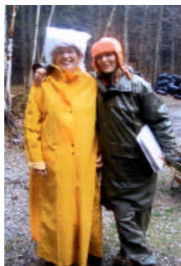
Rain or Shine trail cleaning is a success!