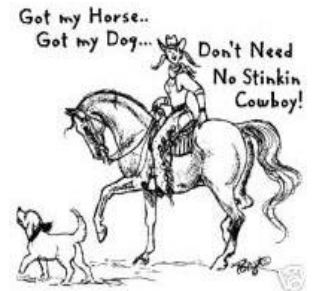
Just a bit of Humor