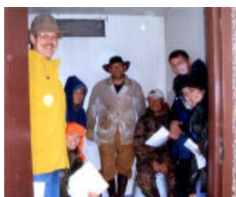
Such a dedicated, invaluable group!