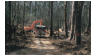
No room for "Big Rigs" Not anymore!

We are also having issues with people taking or destroying the fiberglass sign markers – we will use up the stock supply, than buy wood posts, paint them white and attach numbers, colors and street names. The fiberglass markers are $15-$18 each. Wood markers are much less expensive.